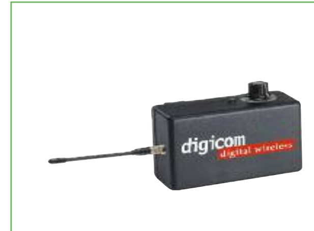
Digicom Digital Wireless CCx System