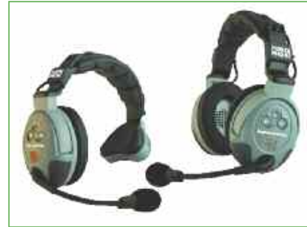
Duplex Wireless System